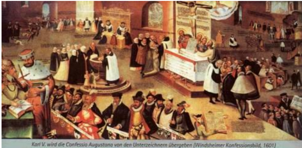
Karl V. wird die Confessio Augustana von den Unterzeichnern übergeben (Windsheimer Konfessionsbild, 1601)