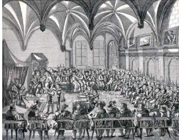
Article VIII: What the Church Is (see Article VII too)

Emperor Charles V summoned the Protestant and Catholic theologians to Augsburg in 1530 to settle the divisions between them. The emperor asked for a concise statement of their beliefs with the intended purpose of finding areas of agreement to keep the empire united.