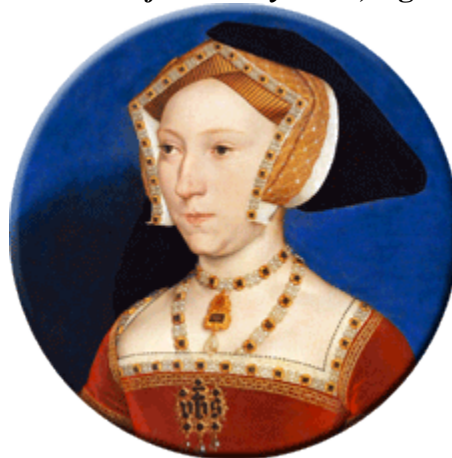
Portrait of Queen Jane Seymour by Hans Holbein

Queen Jane received the last rites from the bishop of Carlisle and died early this morning at Hampton Court Palace in the company of the king. The official cause of her death was diarrhea, which came upon her violently at the christening of her son, Prince Edward. However, her death is more likely from an infection that resulted from a tear in her difficult labor of the new prince.